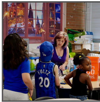
Exploration Day, May 15, 2025 Woodview School