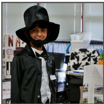
Fourth Grade Illinois Learning Fair, May 13, 2025 Prairieview School

The next scheduled Board of Education general meeting on June 4, 2025, will be held at 6:00 pm and live-streamed online. Please visit d46.org/board-of-education for more information.