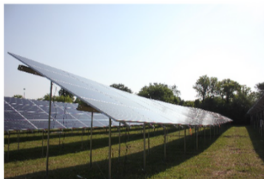
Prairieview School Solar PV System - 634 kWdc