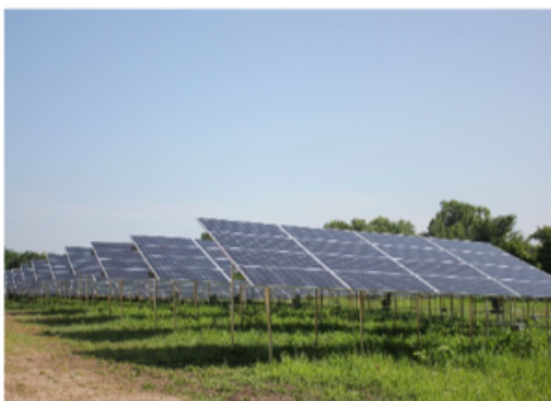
Frederick School Solar PV System - 459 kWdc

View the Sustainability Dashboard on our website to see our daily energy production.