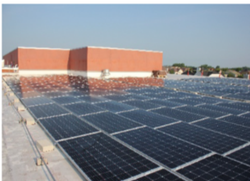
Park Campus Solar PV System - 451 kWdc