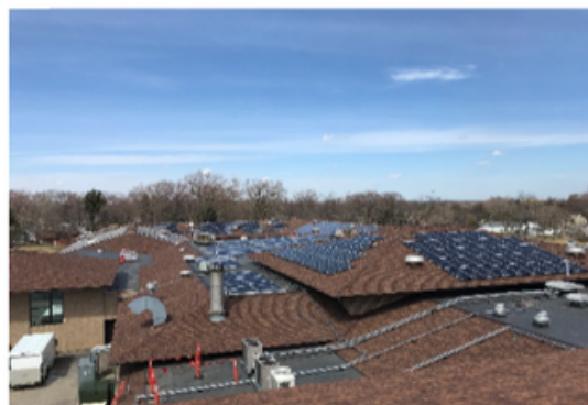
Grayslake Middle School Solar PV System - 8111 kWdc